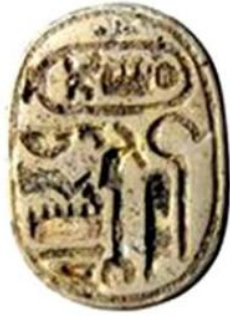
Figure30. Scarab seal from the 26th Dynasty [50].