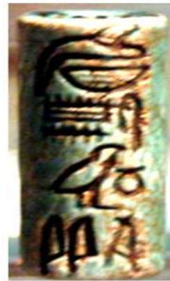
Figure17. Steatite seal of King Senusret I From the 12th Dynasty [35]