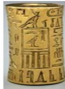
Figure8. Office seal from reign of King Isesi from 5th Dynasty [ 25]