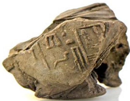
Figure7. Jar seal impression of King Sekhemib, 2nd Dynasty [23].