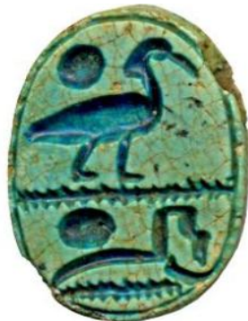
Figure 27. Stamp seal of Siptah from the 19th Dynasty [46].

The eleventh example is a 32 mm height faience scarab seal of Pharaoh Ramses VIII of the 20 th Dynasty (1129-1126 BC) in display in the Metropolitan Museum of Art and shown in Fig.28 [47]. The seal had an oval shape and was deeply engraved inside an oval boundary with a hieroglyphic text belonged to the Pharaoh