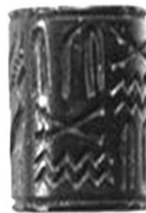
Figure2. Steatite seal from 1st Dynasty [18]