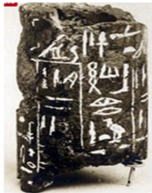
Figure10. Turquoise cylinder seal of King Pepi I. from 6th Dynasty [27]