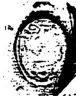
Figure9. Clay seal impression from 6th Dynasty [26].