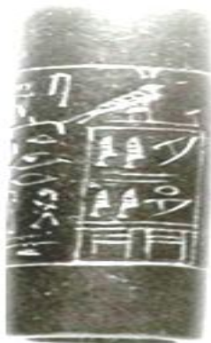
Figure11. Steatite cylinder seal of King Pepi I from the 6th Dynasty [28].