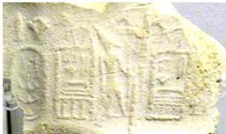
Figure5. Seal impression from King Peribsen tomb, 2nd Dynasty [21].