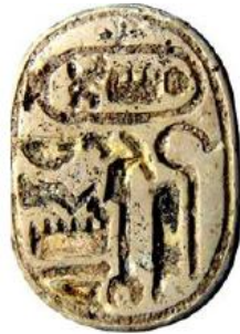
Figure21. Scarab seal from the 18th Dynasty [40].