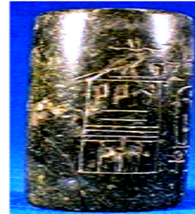
Figure12. Granite cylinder seal of King Pepi I. from 6th Dynasty [29]

Museum of Art at NY and shown in Fig.13 [30]. The impression included a Royal Serekh in its beginning and a hieroglyphic text engraved in un-bounded six columns. The third column of the text included a Royal Cartouche. The museum didn't provide a translation for the impression contents.