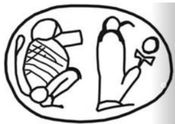
Figure32. Scarab seal impression from the Late Period [52].