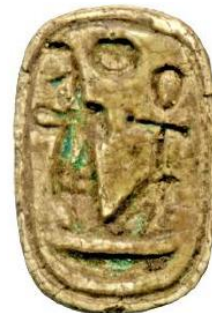
Figure24. Scarab seal of Amenhotep III. from the 18th Dynasty [43].