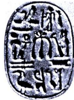
Figure 28. Scarab seal of Ramses VIII from 20 th Dynasty [47]

The eleventh example is a 32 mm height faience scarab seal of Pharaoh Ramses VIII of the 20 th Dynasty (1129-1126 BC) in display in the Metropolitan Museum of Art and shown in Fig.28 [47]. The seal had an oval shape and was deeply engraved inside an oval boundary with a hieroglyphic text belonged to the Pharaoh