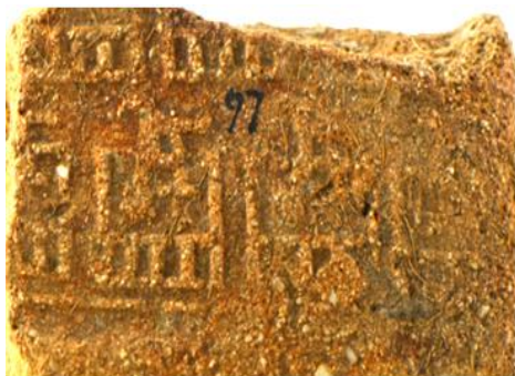
Figure1. Clay jar sealing impression of King Aha from 1st Dynasty [17].