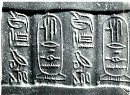
Figure15. Double seal impression from the Middle Kingdom [33]