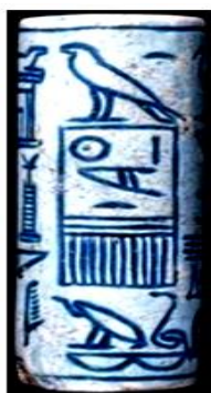
Figure16. Steatite seal of Queen Sobekneferu From the 12th Dynasty [34]