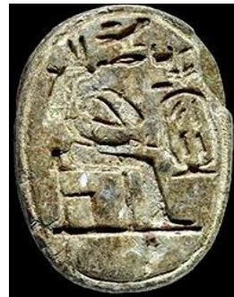
Figure23. Scarab seal of Queen Tiye from the 18th Dynasty [42].