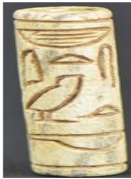
Figure14. Tooth cylinder seal from. the 11th Dynasty [32]