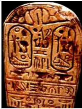
Figure 25. Stamp seal of Ramses II from the 19th Dynasty [44].