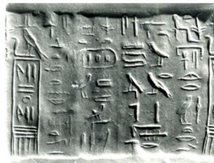
Figure13. Cylinder seal impression from the 6th Dynasty [30].