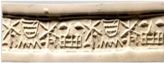
Figure3. Cylinder seal impression from the Early Dynastic Period [19].