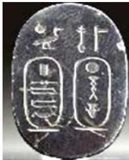
Figure31. Scarab seal of Psamtic I from the 26th Dynasty [51].