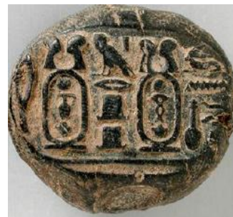
Figure 29. Official clay seal impression from the 26th Dynasty [49].