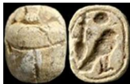
Figure18. Scarab seal from New Kingdom [37].