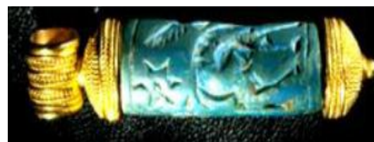
Figure19. Cylinder seal from the 18th Dynasty [38].