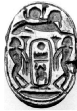
Figure22. Scarab seal of Thutmose III. from the 18th Dynasty [41].