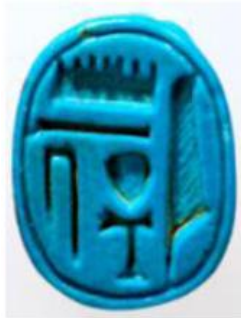
Figure20. Scarab seal from 18th Dynasty [39].