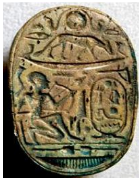
Figure 26. Scarab seal of Ramses II from the 19th Dynasty [45].