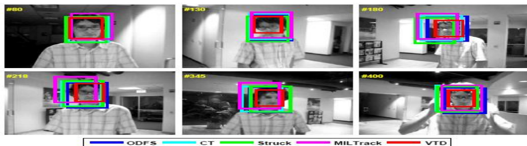
Fig. Some tracking results of video sequence