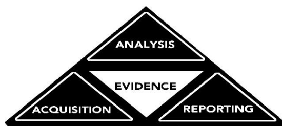
Fig.1. Forensic analysis

Forensic analysis is the uses of documented and controlled analytical and investigative techniques to identity collect examines and preserve digital information. It is used to variety of data theft incidents. Some forensic analysis services are propriety Information theft reconstruction and analysis deleted data recovery and analysis. Digital forensics in a branch of forensic science encompassing the recovery and investigations of material found in digital devices often in relation to computer crime. Digital forensics investigations have a variety of applications. The most common is to support or refute a hypothesis before criminal or civil, courts; forensics may also feature in the private sector such as during internal corporate investigations or Intrusion investigation.