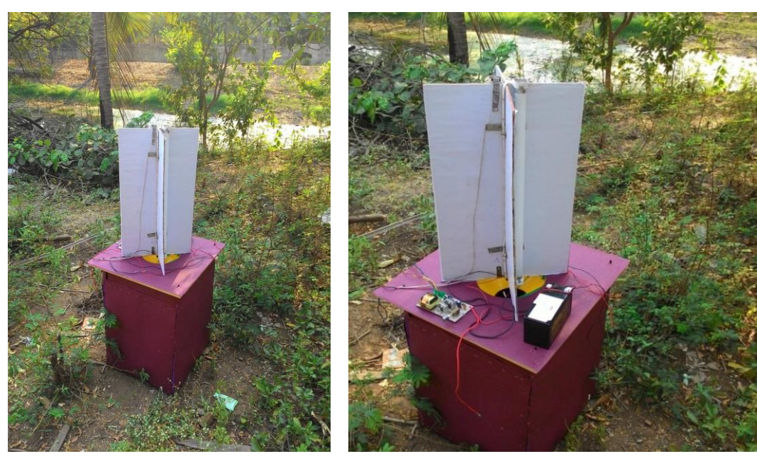
Figure 3. Trap in an Open Field

The trap was placed in an open field in MSSRF, Chennai for a couple of days and the number of insects trapped were observed and the results are tabulated in Table 3.