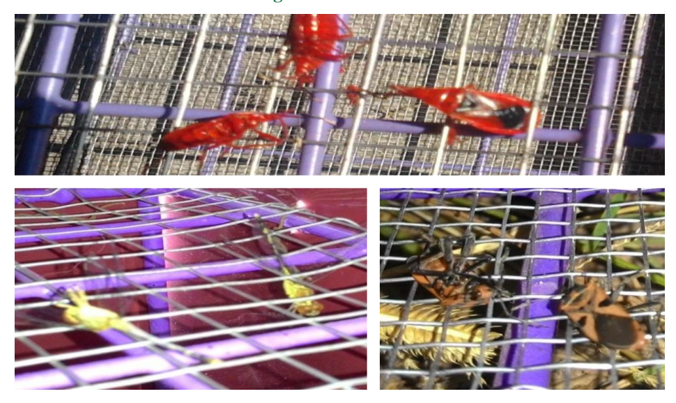
Figure5. Sample insects caught in different layers of proposed designcaptured through web cam