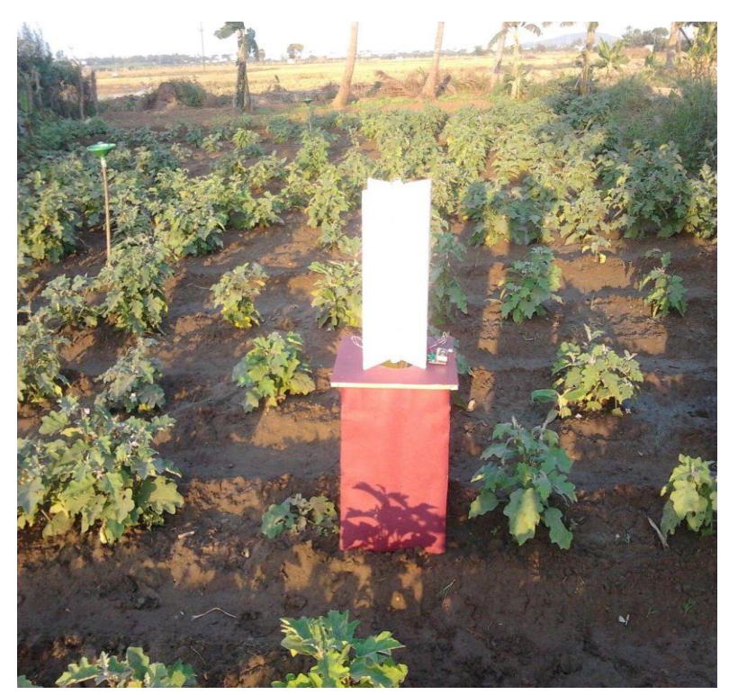
Figure 4. Trap in a Brinjal Field

The trap was placed in a brinjal field and the number of insects trapped was observed and the results are tabulated in Table 4. From table 4, it is witnessed that maximum number of insects trapped during the time interval 7-9P.M.